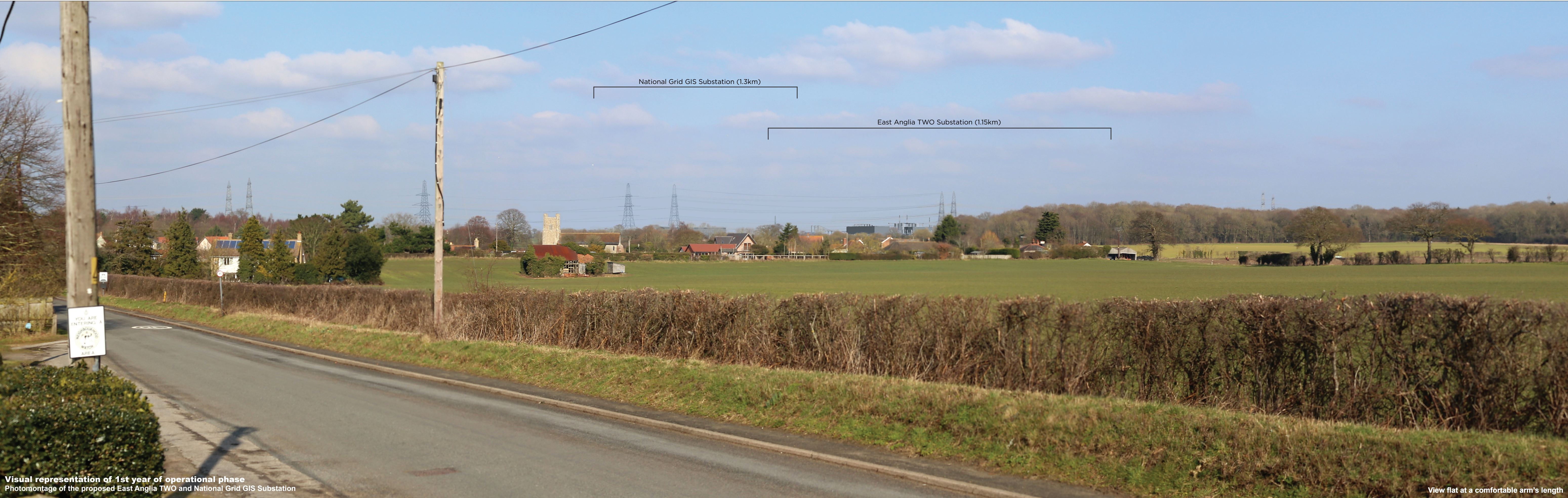
Visual representation of 1st year of operational phase Photomontage of the proposed East Anglia TWO and National Grid GIS Substation