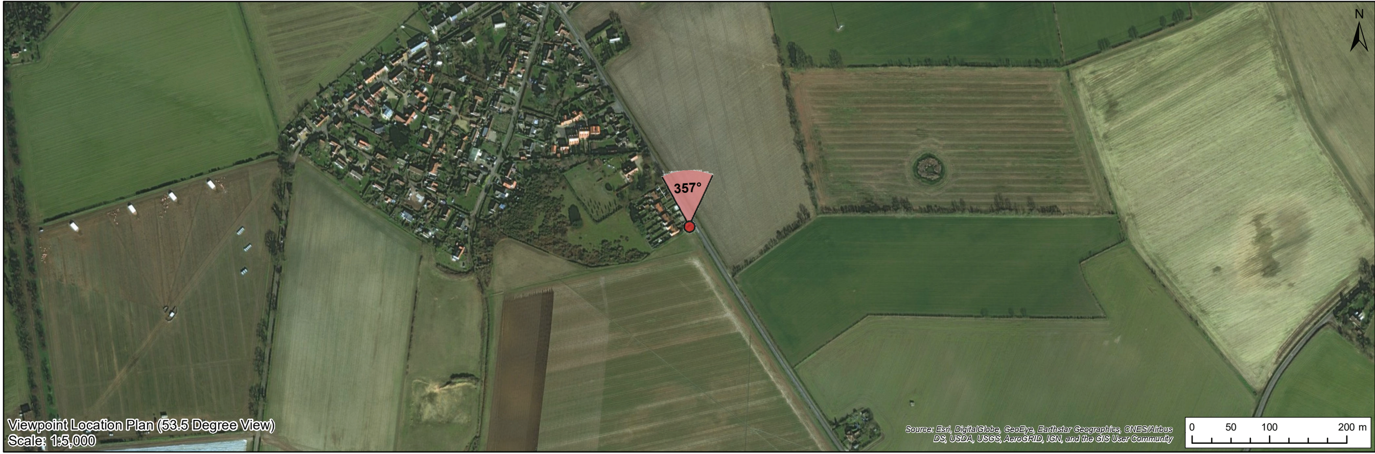
Viewpoint Location Plan (53.5 Degree View) Scale: 1:5,000