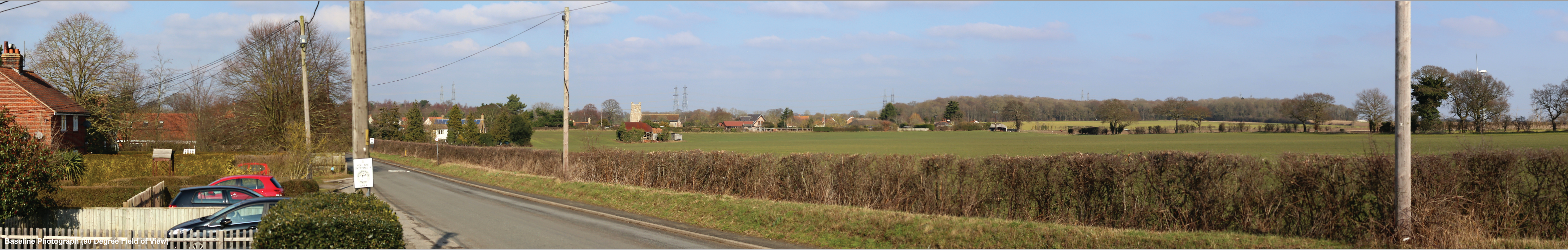
Baseline Photograph (90 Degree Field of View)